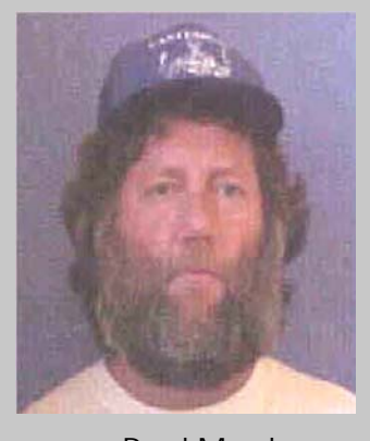
Paul Mock Days 7:00am-3:00pm McConnell 1st Floor & Basement Burton Basement, Glass Washing

Temp Evening 3:30pm-11:30pm 2, 3, 4th Floor, Eng. 2nd Floor Evening