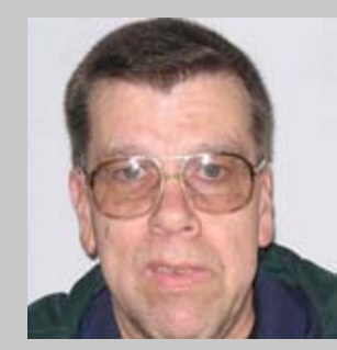
Bruce Teed Evening 3:30pm-11:30pm 3rd,4th Floors 2nd Floor Green Street Annex

Temp Evening 3:30pm-11:30pm 2, 3, 4th Floor, Eng. 2nd Floor Evening