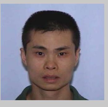
Tan Chen Evening 3:30-11:30pm 2nd Floor