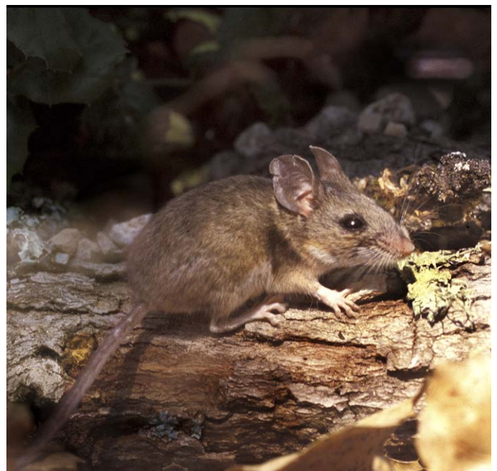
Fig. 1. —An adult male Peromyscus boylii rowleyi from lower Robertson Creek at the Hastings Natural History Reserve, Monterey County, California (22.5 km southeast of Carmel Valley, 36°22’N, 121°22’W). Photograph by Matina C. Kalcounis-Rueppell, 27 July 2002.

CONTEXT AND CONTENT. Order Rodentia, suborder Myomorpha, superfamily Muroidea, family Cricetidae, subfamily Neotominae, tribe Reithrodontomyini, subgenus Peromyscus ; boylii species group (Musser and Carleton 2005). The genus Peromyscus includes 56 nominal species (Musser