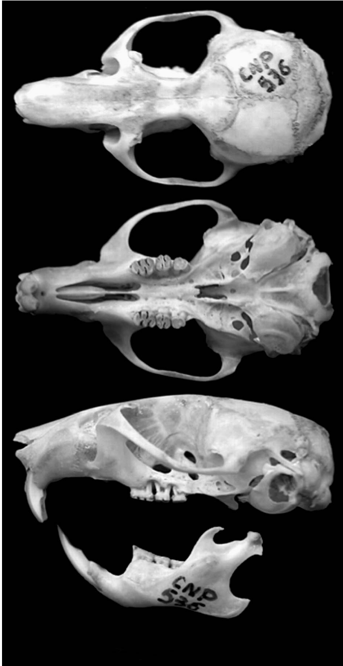
Fig. 2. —Dorsal, ventral, and lateral views of the skull and lateral view of the mandible of adult male Loxodontomys micropus from Estancia La Ensenada, Santa Cruz, Argentina (Colección de Mamíferos del Centro Nacional Patagónico [CNP] 536). Condylolincisive length = 31.5 mm.