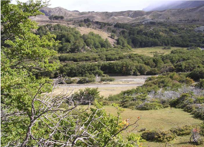
Fig. 4. —One of the habitat types occupied by Loxodontomys micropus ; dense Nothofagus underbrush where L. micropus reaches high densities in western Santa Cruz Province, Argentina (Río Ñires; in the background Cerro Punta de Vacas).

(Pearson 1983). Both sexes were reproductively active after reaching 48 g of body mass (Pearson 1983).