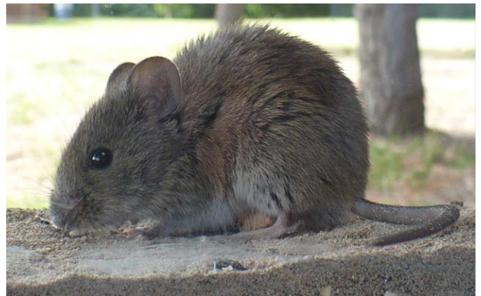
Fig. 1. —An adult male Loxodontomys micropus from El Maitén, northwestern Chubut Province, Argentina.

Euneomys ( Auliscomys ) micropus : Thomas, 1916:143. Name combination.