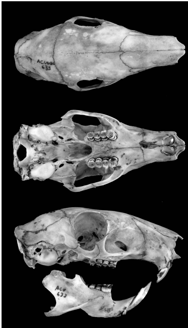
FIG. 2. Dorsal, ventral, and lateral views of cranium and lateral view of mandible of Dasyprocta ruatanica (sex unknown) from Roatán Island, Honduras (ACUNHC 633). Greatest length of skull 101.5 mm. Specimen courtesy of the Abilene Christian University Natural History Collection.

Dasyprocta ruatanica is sympatric with other vertebrates on Fantasy Island, including Artibeus jamaicensis , A. phaeotis , Ctenosaura oedirhina , Iguana iguana , and Rattus rattus . Bats and other arboreal frugivores are important to D. ruatanica because they drop unripe fruit to the ground that otherwise would not be available (Lee et al. 2000; Smythe et al. 1996).