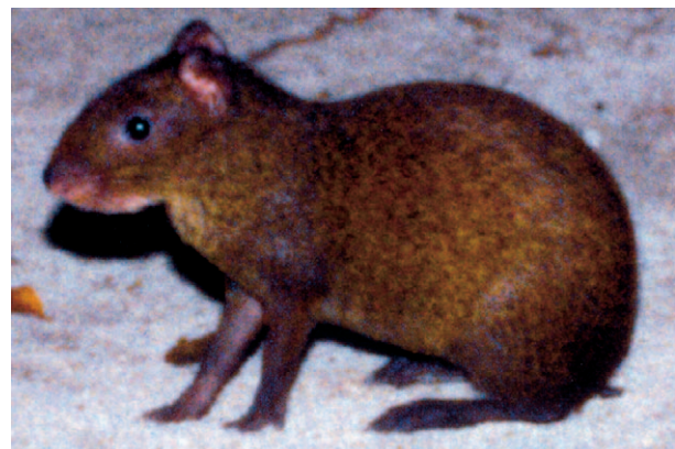
FIG. 1. An adult Roatán Island agouti ( Dasyprocta ruatanica ) from Roatán Island, Honduras.

ECOLOGY. Dasyprocta ruatanica is found in brushy, tropical scrub forests. Most of the scrub forests that still exist are on mountains. Much of the habitat on Roatán has been disturbed by the construction of hotels and houses (Lee et al. 2000). A population of D. ruatanica occurs on Fantasy Island 30 m off the middle south shore of Roatán Island, Honduras (Lee et al. 2000). Much of Fantasy Island (which is 100 m in diameter) is occupied by a resort hotel and hotel grounds. A small hill on Fantasy Island is covered with several species of trees ( Casuarina equisetifolia , Cocos nucifera , Pentaclethra , Swietenia , and Thrinax ) and a patch of bamboo ground cover that D. ruatanica use for sleeping. D. ruatanica were more common on the tree-covered hill, although they use all of Fantasy Island, including areas under the hotel buildings.