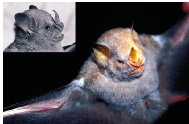
Fig. 1. Photograph of an adult Ariteus flavescens from northwestern Jamaica, Trelawney Parish, near portal of Windsor Great Cave. Inset shows side view of A. flavescens with distinctive nose leaf.

Spermatozoa of A. flavescens have a triangular head with a broad concave base (Forman and Genoways 1979). Head of A. flavescens sperm most closely resembles that of A. nichollsi (Forman and Genoways 1979). Acrosome is extremely pointed at apex and can be symmetrical or asymmetrical and shorter than nucleus. Sperm measurements (in mm; n = 2) are given as mean \pm SE followed by range in parentheses: length of head, 4.60 \pm 0.16 (4.37–4.84); width of head, 3.49 \pm 0.14 (3.26–3.63); length of