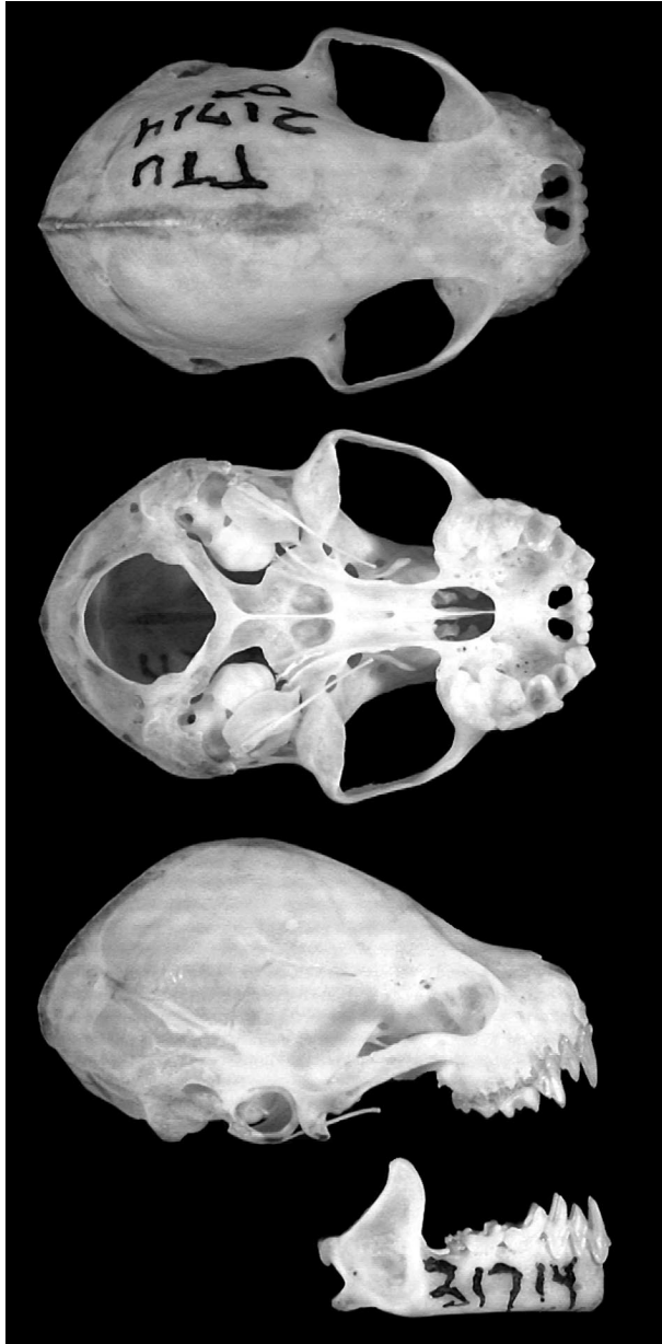
Fig. 2. Dorsal, ventral, and lateral views of cranium and lateral view of mandible of an adult male Ariteus flavescens from Jamaica, St. Ann Parish, Orange Valley (Texas Tech University [TTU] 21714). Greatest length of cranium is 19.05 mm.

acrosome, 2.83 \pm 0.23 (2.60–3.16); and length of nucleus, 3.27 \pm 0.21 (2.88–3.53).