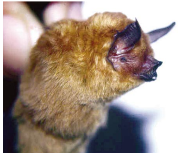
FIG. 1. Photograph of an adult male Pteronotus macleayii from Pinar del Río Province, Cuba.

Plagiopatagium of MacLeay's mustached bat is attached on flanks. Wing membrane and uropatagium attach to ankle via a long ligament that is tightly bound to distal half of tibia. Uropatagium is broad with a small vertical line on free edge (Silva Taboada 1979). Pteronotus macleayii has a wing aspect ratio of 7.56 \pm 0.30 SD ( n = 10) and wing loading of 4.62 \text{ Nm}^{-2} \pm 0.48 SD ( n = 10—Mancina et al. 2004); both indices were calculated according to Norberg and Rayner (1987). Wing morphology permits foraging in more or less cluttered habitats, including edge habitats and forests with clearings. P. macleayii is included in the guild of background cluttered space, aerial insectivorous bats (Kalko 1997).