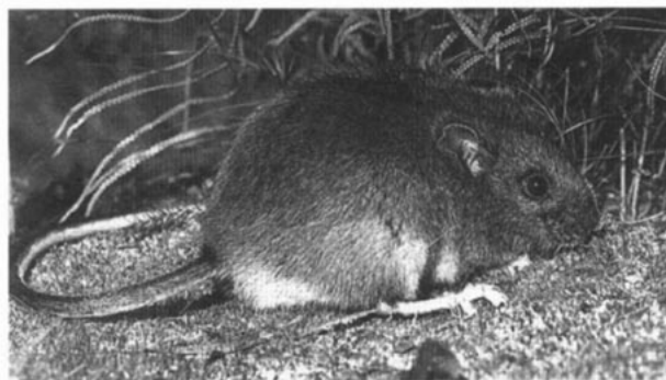
FIG. 1. Pseudomys higginsii .

An extinct subspecies, P. higginsii australiensis , from Pyramids Cave in eastern Victoria, Australia, is distinguished from the extant Tasmanian form by its greater mean tooth size (Wakefield, 1972b). In comparisons of P. h. australiensis and P. h. higginsii ,