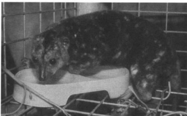
FIG. 1. Adult male Phalanger lullulae (dark morph), National Museum and Art Gallery, Port Moresby, Papua New Guinea.

DIAGNOSIS. The most distinctive feature of P. lullulae (Fig. 1) is its pelage: the dorsal fur is irregularly mottled with brown, ochre, and white, whilst the venter is white with irregular dark spotting. The only other taxa of Phalanger with mottled fur are the nominate subspecies of P. ornatus (Flannery and Boeadi, 1995) and the four species of the subgenus Spilocuscus . Absence of any ochreous coloration in P. ornatus and the enlarged frontal bones,