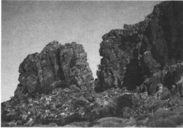
FIG. 4. Representative habitat of Phyllotis xanthopygus . Meseta de Somuncurá, Río Negro Province, Argentina.