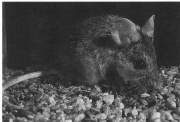
FIG. 1. Adult Phyllotis xanthopygus from Arroyo La Fragua, Río Negro Province, Argentina.

DIAGNOSIS. The sympatric genera we consider most likely to be confused with Phyllotis xanthopygus (Fig. 1) are Auliscomys , Graomys , and Loxodontomys . We follow Steppan (1995) in returning Maresomys boliviensis (Braun, 1993) to the genus Auliscomys . Relative to Auliscomys and Loxodontomys , Phyllotis has a distinctly penicillate tip on the tail that is lacking in the other two genera. When viewed from above, the outer margins of the zygomatic arches are convex in Auliscomys pictus , whereas they are