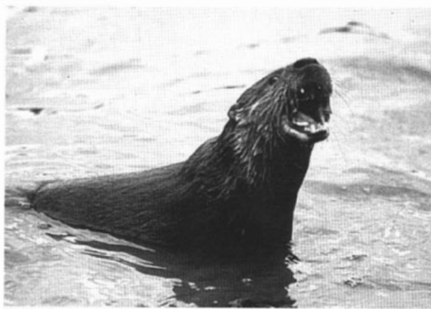
FIG. 1. Adult Lontra longicaudis .

DISTRIBUTION. Lontra longicaudis has the widest distribution of all three South American Lontra species (Chehébar, 1990). It is the most common otter in Mexico (Gallo, 1991), and is present from northwestern Mexico south to Uruguay, Paraguay, and across the northern part of Argentina to Buenos Aires province (Fig. 3; Chehébar, 1990; Cockrum, 1964; Redford and Eisenberg, 1992). The neotropical otter is widespread in the northern and central parts of Argentina (Bertonatti and Parera, 1994) and occurs in all national parks and provincial reserves (Chehébar, 1990). Detailed