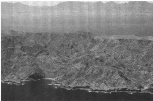
FIG. 4. Aerial view of Montserrat island.

The largest number of specimens were collected on sloping ground near the sea. A lactating female was collected in October 1994.