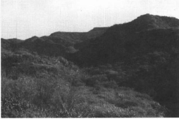
FIG. 3. Habitat of Peromyscus caniceps .