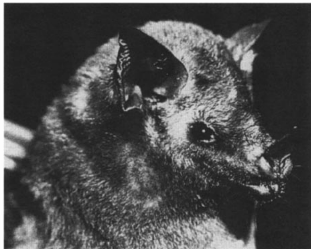
FIG. 1. Photograph of live Glossophaga l. longirostris from Lagunillas, Mérida, Venezuela.

DIAGNOSIS. Glossophaga longirostris (Fig. 1) is the largest member of the genus in most external and cranial dimensions; however, it can be distinguished from its congeners only by a set of cranial and dental characters (Webster, 1993; Webster and Handley, 1986). The diagnostic characters are as follows: premaxillae elongate anteriorly; pterygoid alae absent; presphenoid ridge usually high and complete throughout; mandibular symphyseal ridge absent, chin of mandible receding at a 45° angle; upper incisors noticeably and equally procumbent, I2 equal to I1 in bulk in occlusal view; P4 with reduced lingual cingular shelf; M1 narrow; parastyle of M1 usually absent or, if present, minute and directed