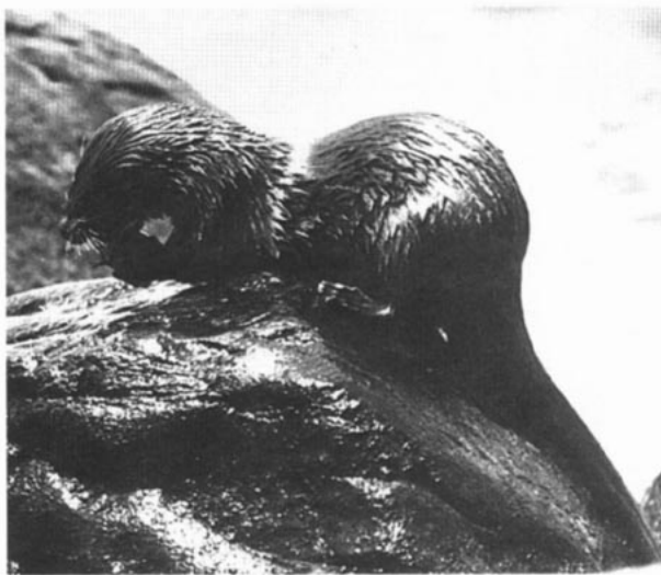
FIG. 1. Adult Lontra felina . (Photograph courtesy of Antonio Larrea M., Chile).

The skull (Fig. 2) is small and has a basal length of 78-90 mm, never exceeding 100 mm (Sielfeld, 1983). Skull measurements (in mm) of marine otters (van Zyll de Jong, 1972) average ( SD , n ): basal length, 80.0 (6.3, 19); interorbital width, 20.1 (1.6, 19); width of the postorbital process, 25.3 (2.1, 19); width of the postorbital constriction, 18.6 (2.2, 19); rostral width, 21.3 (0.9, 13); mastoid width, 54.1 (4.9, 19); orbitonasal length, 22.0 (2.2, 20); and palatal