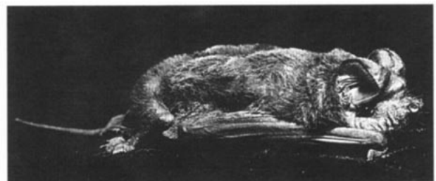
FIG. 1. Male Chaerephon pumilus from South Africa.

DIAGNOSIS. Chaerephon pumilus can be distinguished from other members of the genus by lack of lobe projecting between the inner bases of ears, small size, length of forearm 37-42 mm, and male's unicolor postaural crest, which measures \leq 10 mm (Fig. 1; Hayman and Hill, 1971). The following skull characteristics also distinguish this species: reduced anterior palatal emargination which does not extend behind upper incisors and is separated from incisive foramina by a bony bar; third commissures of the last upper molars well developed and almost as long as the second commissure; basisphenoid pits shallow and separated at most by a low ridge; forehead distinctly elevated; length of maxillary toothrow < 6.3 mm; interdental palate 30% shorter in width than in length (Fig. 2; Meester et al., 1986).