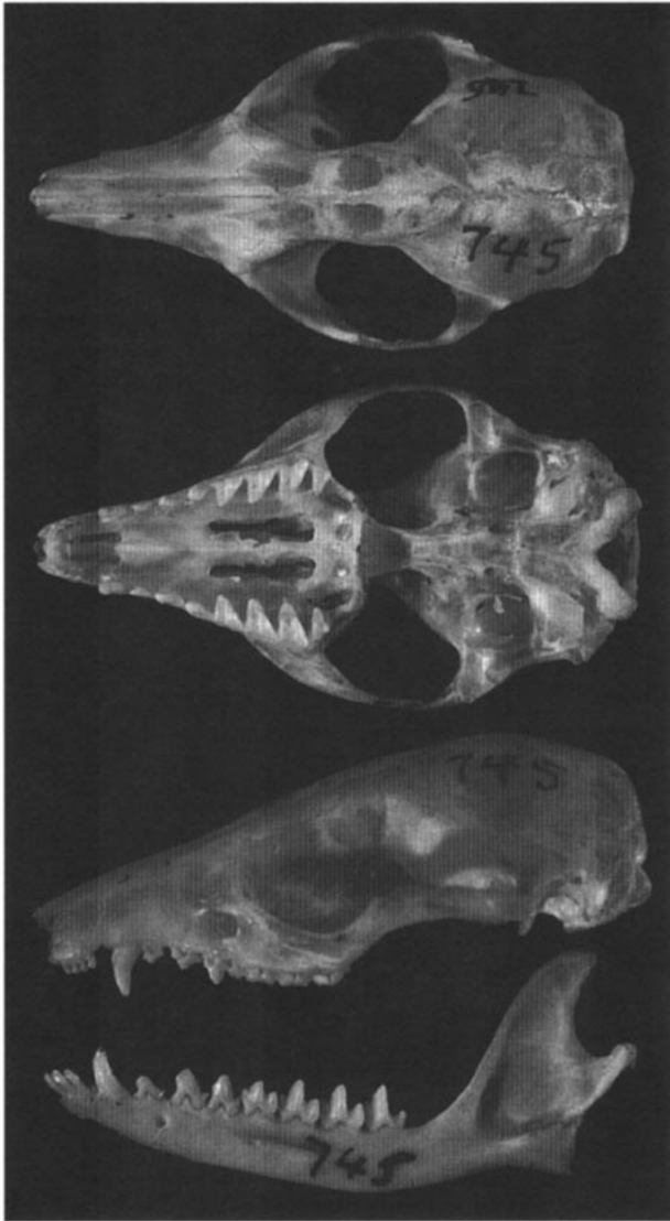
FIG. 2. Dorsal, ventral, and lateral views of skull and lateral view of mandible of an adult Thylamys elegans from Quebrada de La Plata, Santiago (male, Museo Nacional de Historia Natural, Santiago, Chile, no. 745). Greatest length of cranium is 30.5 mm.

Tate, 1933; see Remarks). The nominative form T. e. elegans , occurs mainly along the Coastal Cordillera and adjacent areas in Chile, from the region of Tarapacá southward to the Bío-Bío River (Mann, 1978; Tamayo and Frassinetti, 1980). A specimen collected in Angol Province is "unmistakably elegans subspecies" (Tate, 1933:217). T. e. coquimbensis occurs in the transverse valleys of the regions of Atacama and Coquimbo, its type locality being Paiquano in the latter region (Mann, 1978). Thylamys from the eastern Andes (southern Bolivia and northwestern Argentina), recognized as T. elegans by Cabrera (1958) and Redford and Eisenberg (1992), is recognized by Palma (1994) as T. venusta —as proposed earlier by Tate (1933; see Genetics).