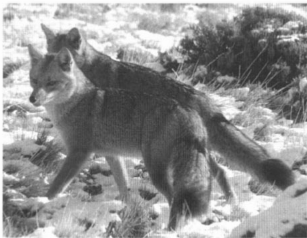
FIG. 1. Adult male and female Pseudalopex culpaeus from Monumento Natural Bosques Petrificados, Santa Cruz Province, Argentina.

P. c. magellanica (Gray, 1837a). See above. C. prichardi Trouessart is a synonym.