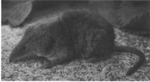
FIG. 1. Sorex granarius from Peñalara Natural Park, Madrid, Central Spain.

granarius penetrates the Eurosiberian region, where it appears in forests of Q. pyrenaica and in plantations of Eucalyptus and P. pinaster that have replaced native forests (Gisbert et al., 1988). In this area, S. granarius is absent in places where annual rainfall is <500 mm (C. Nores, pers. comm.)