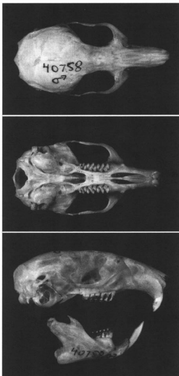
FIG. 1. Dorsal, ventral, and lateral views of cranium and lateral view of mandible of Neotoma goldmani from 3 mi. SE Torreón, Coahuila (male, Museum of Natural History, University of Kansas, 40758). Greatest length of cranium is 37.68 mm.

constriction, 5.5 (5.3-5.7), 5.7; length of palatal bridge, 6.1 (5.9-6.5), 6.2; length of palatine slits, 8.9 (8.8-9.0), 8.7; and alveolar length of maxillary toothrow, 8.2 (7.9-8.3), 8.2 (Baker, 1956). Mean external and cranial measurements (in mm) of two females and two males from San Luis Potosí respectively, are: total length, 247, 271; length of tail, 120, 123; length of hind foot, 29, 30; length of ear,