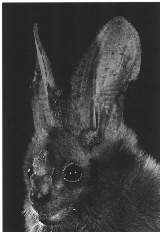
FIG. 1. Photograph of Cardioderma cor.

Audible (to humans) vocalizations include a "territorial song" and "flight call" (Vaughan, 1976:233). The territorial song consists of 4-9 high intensity pulses of approximately 12 kHz. Flight calls