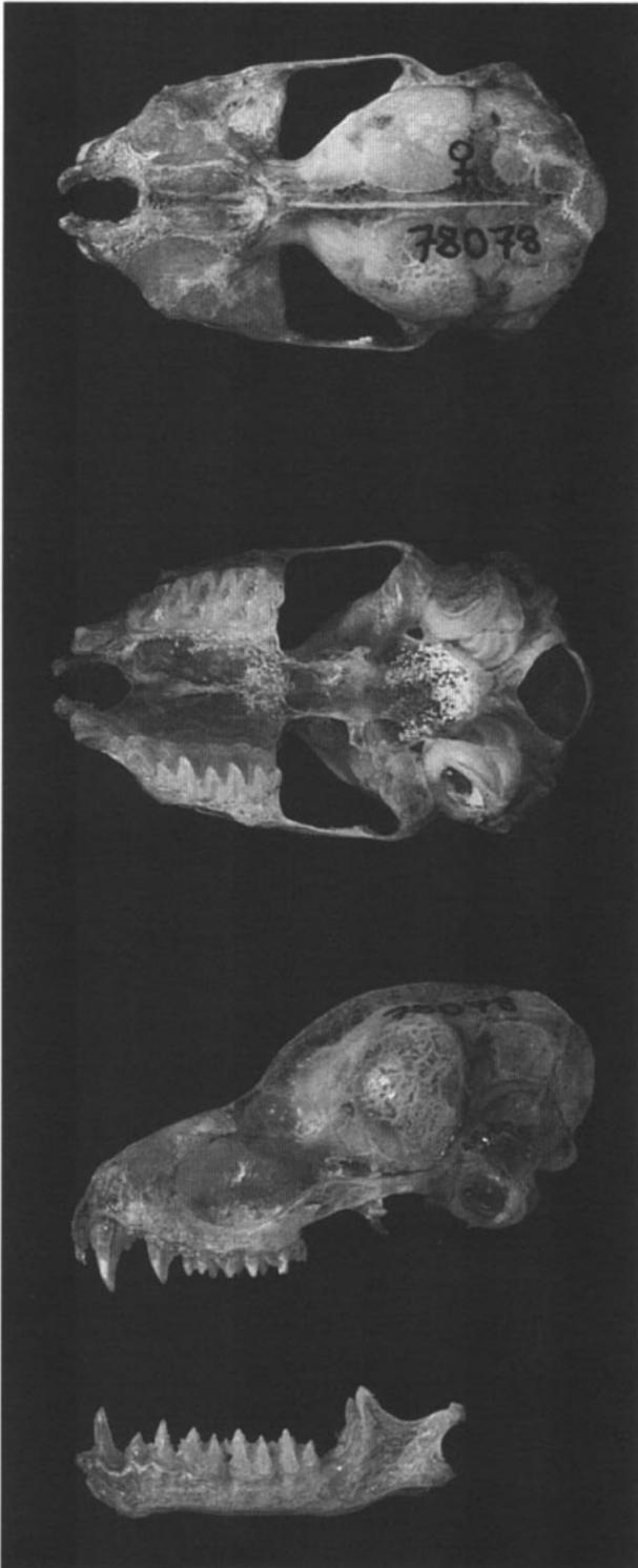
FIG. 2. Dorsal, ventral, and lateral views of the cranium and lateral view of the mandible of a female Cardioderma cor (length of skull = 26.0 mm; Royal Ontario Museum specimen 78078).

consist of a series of pulses (usually 3–10) that are more widely spaced than the song and each pulse has a rise in frequency peaking at 12 kHz. Echolocation calls of Cardioderma have most energy at 42 kHz and include a harmonic at 63 kHz (O'Shea and Vaughan, 1980).