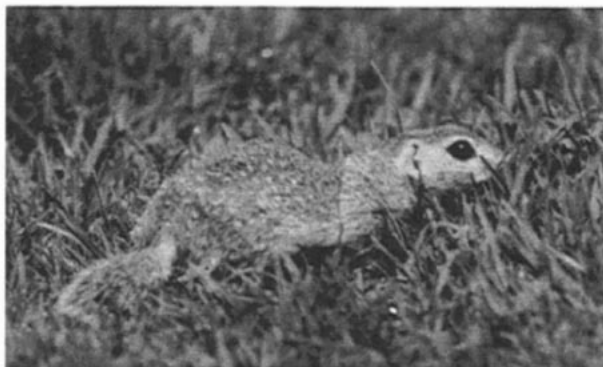
FIG. 1. Spermophilus perotensis near Perote, Veracruz, Mexico.

There is little variation among individuals of S. perotensis , except in the degree of visibility of the obsolescent spots and the tint of the upperparts. This difference results from the wearing off of the tips of the hairs (Merriam, 1893). Means and ranges of external and cranial measurements (in mm; n = 11 ) are: total length, 250 (243-261); length of tail, 71 (57-78); length of hind foot, 39