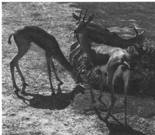
FIG. 1. Photographs of a male (above) and a female (below) of Gazella gazella from Israel.