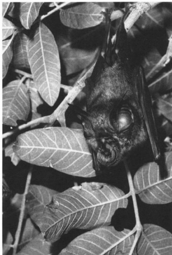
FIG. 1. Rhinolophus hildebrandti photographed in Zimbabwe.

DISTRIBUTION. R. hildebrandti is restricted to east Africa (Fig. 3). Although ranging as far south as Transvaal (South Africa), it is inexplicably absent from the western woodland regions of northern Botswana, Caprivi, and southeastern Angola (Rautenbach, 1982). Francistown in Botswana forms the western limit (Smithers, 1971); Kenya, Somalia, and Ethiopia are the most eastern localities recorded on the continent (Dorst and Prevost, 1971). R. hildebrandti is found as far north as the Sudan (Koopman, 1975).