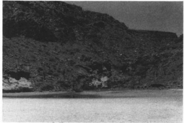
FIG. 3. Habitat of Lepus insularis on Espiritu Santo Island, Baja California Sur, Mexico.

A valley in the southern part of the island, and favorable places elsewhere on lower slopes, have many scattered arid-tropical and