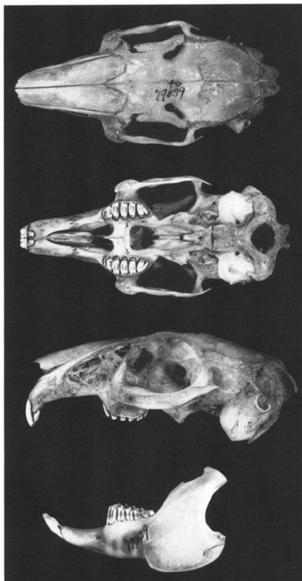
FIG. 1. Dorsal, ventral, and lateral views of cranium and lateral view of mandible of Lepus insularis from Espiritu Santo Island, Baja California Sur (sex unknown, United States National Museum of Natural History 79039). Greatest length of cranium is 95.0 mm.

FORM AND FUNCTION. At a short distance, L. insularis appears coal black, and is extraordinarily conspicuous on open or