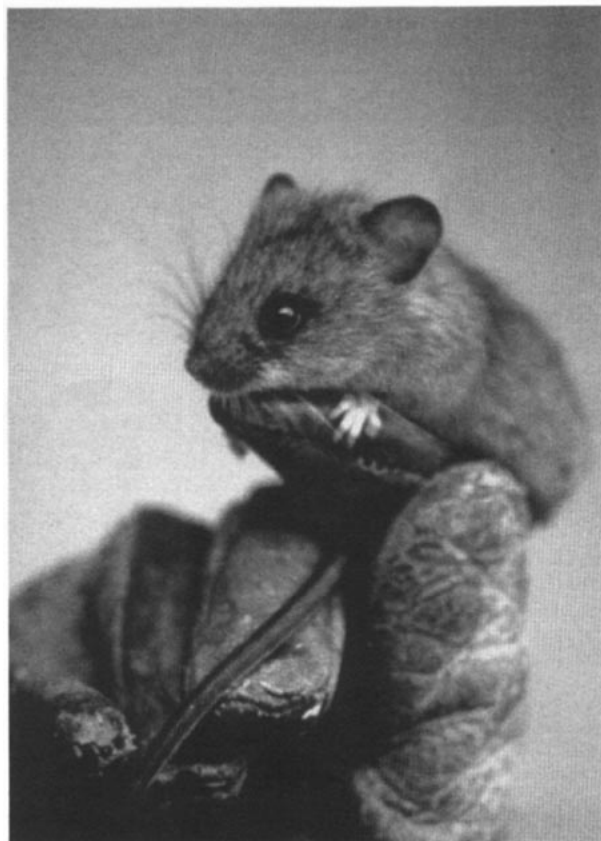
FIG. 1. External appearance of Irenomys tarsalis . Note the large eyes, soft pelage, and long tail.

ECOLOGY. Irenomys tarsalis breeds in spring, although this may be prolonged into late summer (Pearson, 1983). In Argentina, specimens captured in October and mid-November were in breeding condition (testes enlarged and descended), whereas specimens captured in autumn were not (Pearson, 1983). In Chile, males have been collected with descended and enlarged testes in February, March, May, and June. Females in Argentina have been collected in breeding condition in October and mid-November (Pearson, 1983).