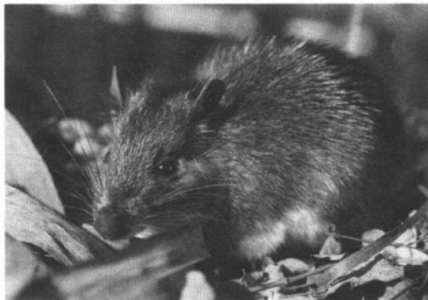
FIG. 1. Live specimen of Proechimys dimidiatus from Teresópolis, state of Rio de Janeiro.

The baculum in P. dimidiatus is an elongate and narrow structure with a straight shaft. The shaft does not show any development of a dorsoventral curvature, but has a lateral indentation near mid-shaft. The proximal and distal ends are evenly round, and the latter shows no development of apical wings or median depression (Pessôa and dos Reis, 1992).