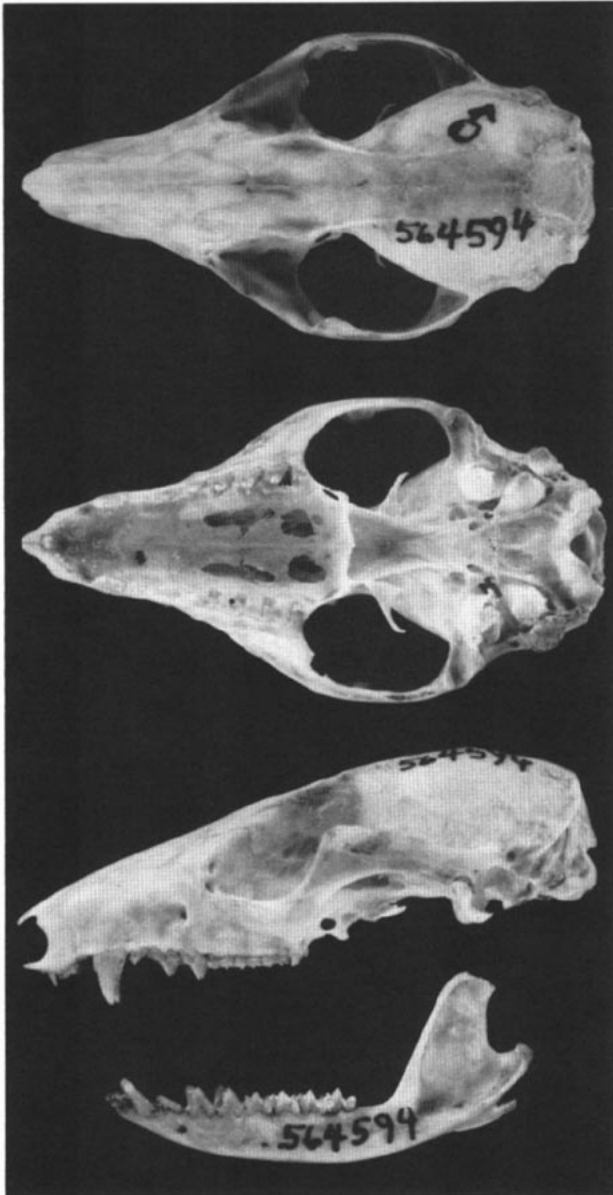
FIG. 2. Dorsal, ventral and lateral views of cranium, and lateral view of mandible of Marmosa mexicana, (United States National Museum 564594) from Chiquimula, Guatemala. Greatest length of skull is 37.7 mm.