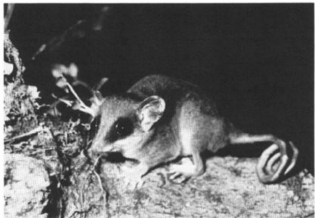
FIG. 1. Marmosa mexicana from Peñas Blancas, Monteverde Cloud Forest Reserve, Costa Rica.

DISTRIBUTION. Marmosa mexicana occurs in the eastern part of México from southern Tamaulipas, San Luis Potosí, Veracruz,