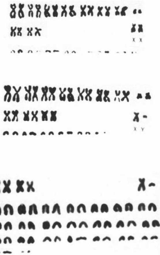
FIG. 3. Karyotype of Chaetodipus pernix pernix from near Pericos, Sinaloa (upper; 2n = 38 ) and from near Playa de Novilleros, Nayarit (middle; 2n = 36 ), and of C. pernix rostratus from near Vicam, Sonora (lower; 2n = 52 ).

Chaetodipus pernix is granivorous (Morton, 1979). At Ciudad Obregon, their cheek pouches contained seeds of Opuntia , whereas the food was grass seeds along the Río Mayo near Tésia (Burt, 1938). Mammals occurring with C. pernix include Notiosorex craw-