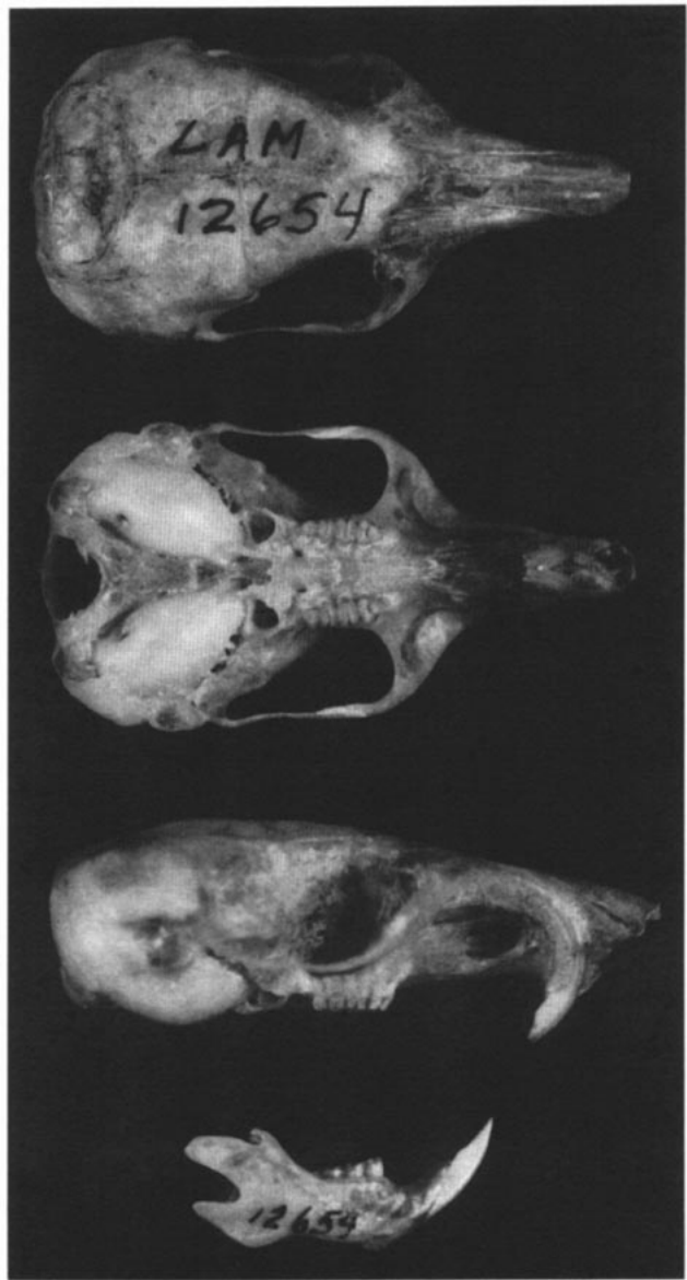
FIG. 1. Dorsal, ventral, and lateral views of cranium and lateral view of mandible of Chaetodipus pernix from Puerta de Canoá, Sinaloa, Mexico (female, Natural History Museum of Los Angeles County 12654). Greatest length of cranium is 24.0 mm.

DISTRIBUTION. Chaetodipus pernix occurs from the coastal plain of southern Sonora to northern Nayarit, Mexico (Fig. 2; Hall, 1981). The northernmost locality of this species is Presa Alvaro Obregon, north of Ciudad Obregon, Sonora, in the coastal delta of the Río Yaqui. The record for C. pernix from Tecoripa in the central Río Yaqui basin given by Burt (1938) is based on misidentified specimens of C. penicillatus (J. L. Patton, in litt.). The species has been reported from Hacienda Island, west of Escuinapa, Sinaloa (Allen, 1906). It occurs at an elevation of 8 m near Mazatlan, Sinaloa (Baker, 1962), and at an elevation of 90 m near Chele,