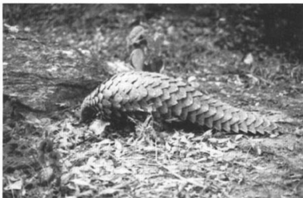
FIG. 1. Adult Manis temminckii . At Chipengali Wildlife Orphanage, Bulawayo, Zimbabwe.

GENERAL CHARACTERS. Manis temminckii has no teeth. It is a medium-size mammal with an elongate, streamlined body and anatomical adaptations for procuring and eating ants and termites. The head is small and cone-shaped, blending into the thicker streamlined body without an identifiable neck. Large (2-5 cm) overlapping yellow-brown scales, made of agglutinated (fused) hair, cover the dorsal and lateral surfaces, both sides of the tail, and the outer surface of the legs. The ventrum of the head and trunk and the inside of the legs are covered with sparse hair. When the Cape pangolin rolls into a sphere as defense, only sharp scales are exposed to predators (Haltenorth and Diller, 1977; Kingdon, 1974; Pocock, 1924).