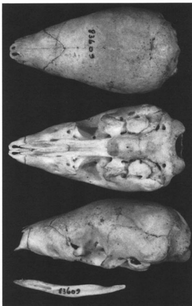
FIG. 2. Dorsal, ventral, and lateral views of the cranium and lateral view of the mandible of female Manis temminckii (American Museum of Natural History, New York, 83609, from Transvaal, South Africa). Greatest length of cranium is 75.4 mm.

Males are larger than females. The mass of 36 adult specimens from Zimbabwe is 4.6-10.09 kg for females and 10.7-15.9 kg for males. Measurements (mm) for female and male adults are: head and body length, 447-470, 495-550; tail length, 395-420, 438-