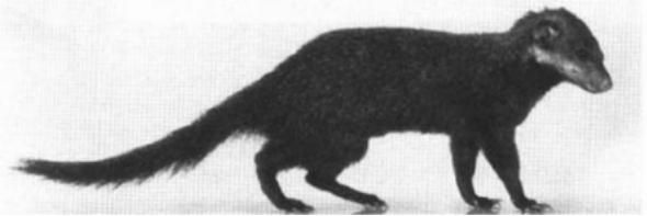
FIG. 1. Female adult Crossarchus ansorgei nigricolor . Collected at Amadjabe, Zaire. Collection of M. Colyn.

DISTRIBUTION. Crossarchus ansorgei inhabits the high forest south of the Zaire River and west of the Lualaba River, Zaire, and the southernmost portion of the Dembos Forest, north of the Cuanza River, Angola (Fig. 3). C. ansorgei has been collected from the type locality in northern Angola (Dalla Tando = Ndala Tando; 0°18'S, 14°54'E) and five localities in Zaire: Amadjabe (00°04'S, 25°17'E), Baringa (00°45'N, 20°52'E), Ikela (01°11'S, 23°16'E), Kodoro (01°16'N, 20°06'E), and Yaenaro Plantation (00°12'N, 24°47'E; Thomas, 1910; Coetzee, 1977; Colyn and Van Rompaey, 1990). Thus the known distribution in Zaire (Fig. 3) is in the rain forest southeast of the Zaire/Lualaba rivers. The species is quite common in the Subregion Tshopo (part of the Région Haut-Zaïre, south of Kisangani) but it is unlikely that it may range to central Kivu, as suggested by Coetzee (1977), where it has never been collected in spite of numerous expeditions by the Institut de Recherches Scientifiques of Bukavu; nor has the species been collected or known to natives north and east of the Zaire/Lualaba rivers (Colyn, 1984). The type locality lies in the southernmost portion of the Dembos forest, north of the Cuanza river, Angola (Goldman, 1984). According to Crawford-Cabral (1987) it would be confined to the northern part of the escarpment zone in Angola.