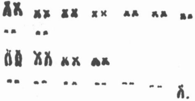
FIG. 4. Karyotype of a male Micronycteris megalotis .

In Costa Rica, M. megalotis takes a large percentage of beetles at the end of the rainy season (70% of the total number of items), whereas in the dry season beetles taken decrease to about 30% and orthopterans increase to >40%; Lepidoptera, mostly moths, accounted for 40% of one rainy season sample (LaVal and LaVal, 1980). During 1 year in Panamá, dipterans represented 59% of the food types in fecal samples, and coleopterans 24% (Humphrey et al., 1983). It has been suggested that M. megalotis switches to fruits during the dry season in Panamá (Bonaccorso, 1979). Some discrepancies in diet analysis might be expected because soft fruit parts may be quickly digested or rendered unidentifiable (Whitaker and Findley, 1980). The stomachs of individuals taken during the day in Veracruz, México, were empty, but stomachs of those collected