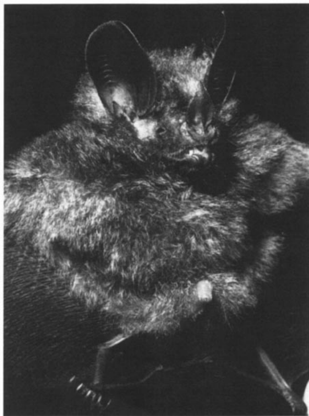
FIG. 1. Micronycteris megalotis from Heredia, Costa Rica.

The skull of M. megalotis is small and slender with a high, abruptly-rising forehead (Fig. 2). The sagittal crest is weak, but distinct. The braincase is swollen. The rostrum is narrow and tapering, with the interorbital region relatively swollen. The pterygoids are strongly divergent. The mandible is long with a long, ascending ramus, and a blunt coronoid process. The teeth are robust and relatively primitive. The upper, inner pair of incisors is large and chisel-shaped, and the outer incisors are small. The lower incisors are short, forming a continuous row between the canines. Upper canines are heavy and slightly divergent. Premolars are approximately equal in size, with one cusp each. Molars are delicate, with