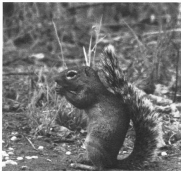
FIG. 1. Unstriped ground squirrel, Xerus rutilus , from near Kibwezi, Kenya.

Sexual dimorphism is not readily apparent, but has not been thoroughly studied. Ranges of selected external and cranial measurements (in mm) are (Delany, 1975; Dollman, 1911; Hollister, 1919; Ingersol, 1968; Kingdon, 1974; Toschi, 1945): total length, 320-440; length of head and body, 200-240; length of tail, 120-225; length of hind foot, 35-60; length of ear, 7-19; condylobasal length, 41.9-53.4; zygomatic breadth, 26.4-33.3; interorbital