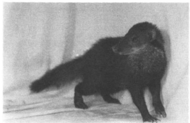
FIG. 1. Adult male Liberian mongoose ( Liberiictis kuhni ), collected about 20 mi SE Tapeta, Nimba Co., Liberia, 6 February 1989.

DISTRIBUTION. Liberiictis kuhni has been collected from seven localities in northeastern Liberia (Fig. 3): Gaplay (=Gape; 7°08'N, 8°28'W); Kpeaplay (=Kpeaple; 6°36'N, 8°30'W); Tappita area (=Tapeta; about 6°30'N, 8°52'W); 20 mi SE Tapeta, Gbi National Forest (6°25'N, 8°45'W); near Nimbo When (=Nimbo-wehn), Gbi National Forest (6°12'N, 8°47'W), Nimba County; and "Frog-City" and Tar (both about 25 km N Zwedru (=Tchiehn; 6°13'N, 8°08'W), northern Grand Gedeh County (Hayman, 1958; H. Kuhn, in litt.; Schmitter, 1974; Taylor, 1989). L. kuhni may also occur in suitable habitats in western Ivory Coast and southern Guinea.