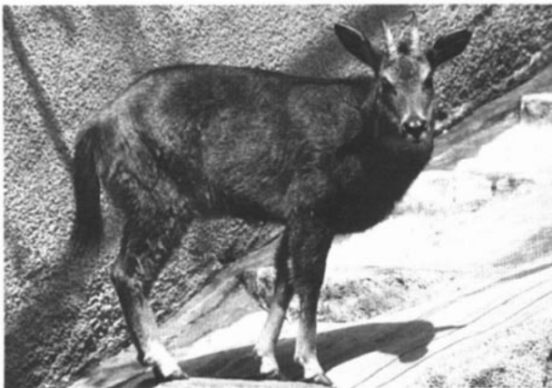
FIG. 2. Photograph of mature Nemorhaedus goral at San Diego Zoo.

and 109 mm for females (Zhang, 1987). The goral has a short, woolly undercoat, covered by long, coarse guard hairs (Fig. 2). Males have a short, semierect mane, except in " cranbrooki " (Zhang, 1987). Coloration varies from buffy gray to dark brown to a bright foxy red to tawny buff. There usually is a white patch on the throat and a dark dorsal stripe. Females have four mammae. Pedal interdigital glands are present as are glands behind the horns (Sokolov et al., 1982), but there are no inguinal glands. Measurements of the skull (in mm) are (Allen, 1940; Geptner et al., 1961; Volf,