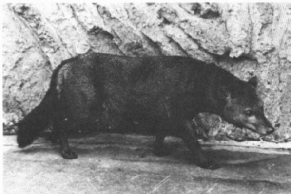
FIG. 1. Adult male Atelocynus microtis .

The following means (extremes and sample size in parentheses) are measurements of adults (in mm) assembled by Hershkovitz (1961): length of head and body, 807 (720 to 1,000; n = 9 ); length of tail, 305 (260 to 350; n = 8 ); length of hindfoot, 138 (125 to 150, n = 4 ); length of ear, 45 (34 to 52; n = 6 ). Tooth and cranial