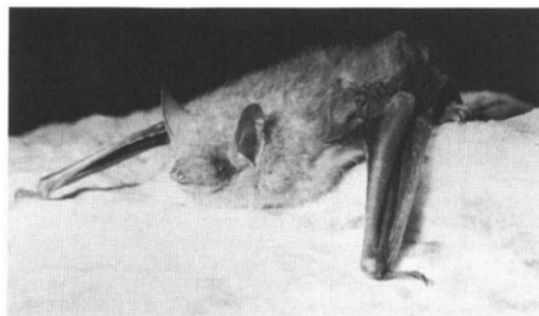
FIGURE 1. Photograph of an alert Pipistrellus subflavus roosting on the wall of a cave in Kansas.

DISTRIBUTION. Pipistrellus subflavus occurs throughout most of eastern North and Central America and in parts of the midwestern United States (Fig. 3). The eastern border of the range of the subspecies subflavus follows the Atlantic seaboard from Georgia north to Nova Scotia. The northern border extends eastward along the extreme southeastern portions of Quebec and Ontario to central Minnesota. Marginal records from Michigan, not reported in Hall (1981), are known from the western Upper Peninsula. Although Hall's (1981) range map indicates that P. s. subflavus extends into southeastern Michigan, the only known marginal record from the Lower Peninsula of Michigan is from the southwest corner (Kurta, 1982). The westernmost border extends to the Edwards Plateau of Texas south to Tamaulipas, Mexico (Davis, 1959a). The Gulf of Mexico along the Florida panhandle marks the southernmost border. Pipistrellus s. floridanus occurs throughout peninsular Florida north to southeastern Georgia. The range of P. s. clarus extends from northern Coahuila in Mexico to adjacent parts of Texas and is separated from P. s. subflavus by the Rio Grande Valley that may serve as an ecological barrier (Davis, 1959a). P. s. veraecrucis is known from the tropical lowland and mountainous regions of eastern Mexico, and the northeastern portion of Honduras (Davis, 1959a).