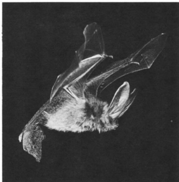
FIGURE 2. Photograph of a flying Plecotus townsendii .

A distinguishing feature of P. townsendii , as well as other plecotine bats, is the large size of the pinnae. In flight they are often directed forward in plane with the body (Dalquest, 1947; Handley, 1959), suggesting that they may provide some lift during flight. A thermoregulatory function of these highly vascularized structures has also been suggested (Humphrey and Kunz, 1976). More often it is stated that the function of the pinnae is of funneling sounds into the external auditory meatus (Henson, 1970).