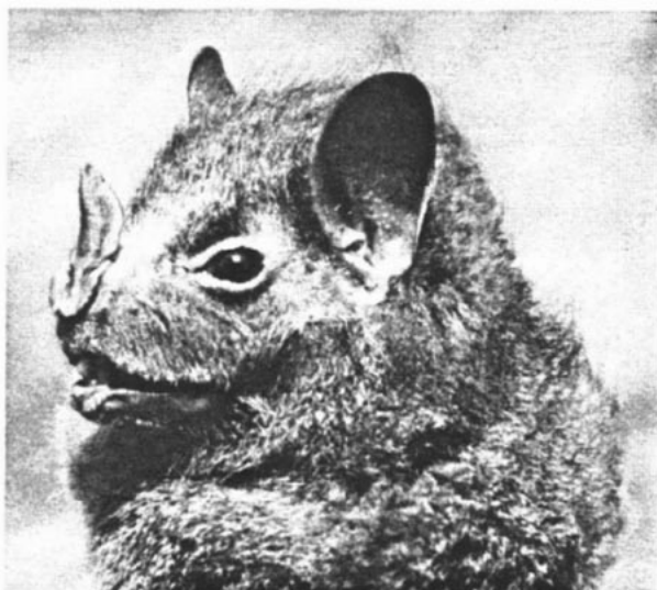
FIGURE 1. Young adult female Chiroderma improvisum (TTU 31403) photographed in life on Montserrat.

ECOLOGY. Little is known of the natural history of C. improvisum ; presumably it is frugivorous like other members of the genus. The holotype was taken in a mist net "at sea level in