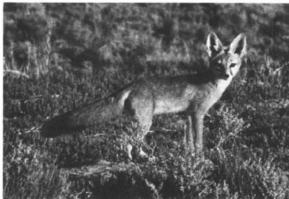
FIGURE 1. A young V. m. nevadensis at a den near Deseret, Millard Co., Utah.

Color and texture of the pelage vary geographically. In general, dorsal coloration is a light grizzled- or yellowish-gray. The grizzled appearance results from guard hairs which are typically black-tipped or with two bands of black separated by a band of white. Guard hairs are less than 50 mm long (Mayer, 1952) and especially prominent on the middle of the back. The underfur is heavy and slightly harsh in texture. Dorsally this fur is gray at the base, becoming paler on the sides, and light buff to white on the underparts (Grinnell et al. , 1937). The ears are tan or gray on the back, changing to buff or orange at the base. The pinnae have a thick border of white hairs on the forward inner edge and inner base. The sides of the muzzle, the lower lip and the pos-