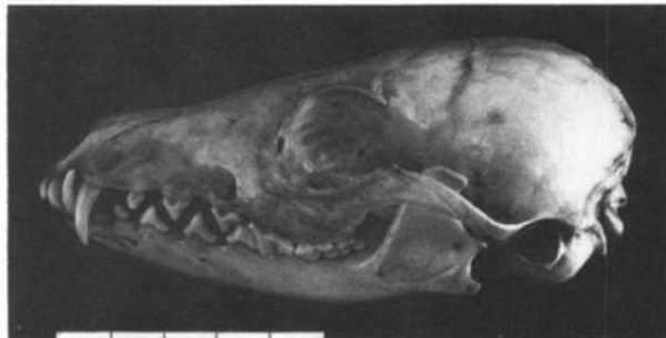
FIGURE 3. Lateral view of skull of same specimen shown in Figure 2. Scale represents 50 mm.

The original descriptions of the several subspecies were based on small numbers of specimens and generally consisted of