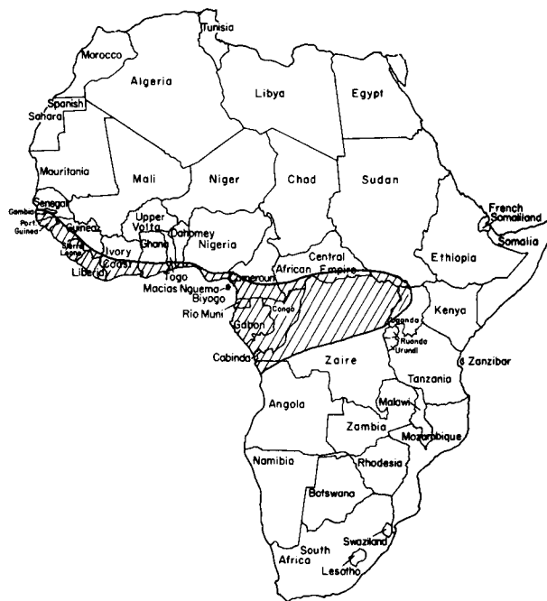
FIGURE 2. Distribution of Dendrohyrax dorsalis . For details about subspecies, see the section on distribution.

Because of the unique umbraculae, hyraxes apparently can look directly at the sun. In addition, the animals spend long periods of time with a fixed, starelike visage.