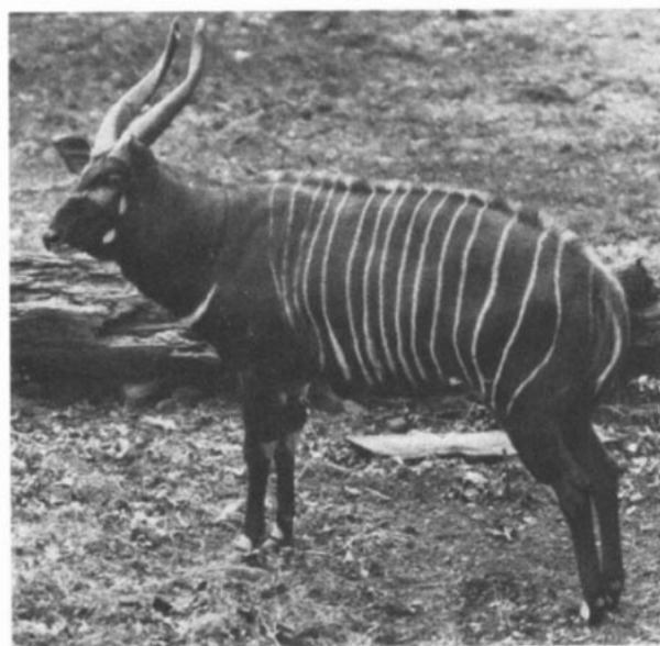
FIGURE 1. Photograph by Kent Redford of an adult male bongo, captured in Kenya, now at the National Zoological Park.

In East Africa, it is on Mt. Kenya, and in the Aberdare and Mau forests of Kenya. It no longer occurs in the Cherangani Hills and Chepalungu Forest (Anon., 1977). In view of the close resemblance between the distribution of the bongo and that of the giant forest hog, Hylochoerus meinertzhageni , it seems possible that the bongo may occur, or may once have occurred, in the montane