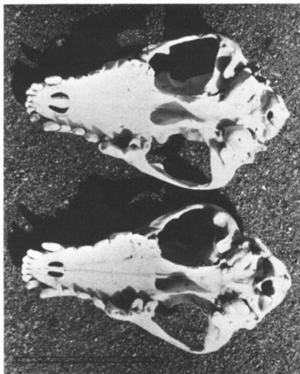
FIGURE 2. Ventral view of skulls of domestic dog (below) and dhole (above). Scale at lower left represents 100 mm.