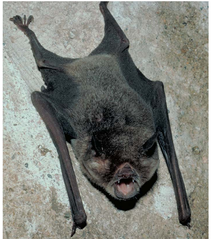
Fig. 1.—Adult Pteronotus personatus psilotis from Chamela, Jalisco, Mexico.

NOMENCLATORIAL NOTES. Pteronotus personatus is often placed in the subgenus Chilonycteris proposed by Smith (1972) and recognized by Simmons and Conway (2001). This