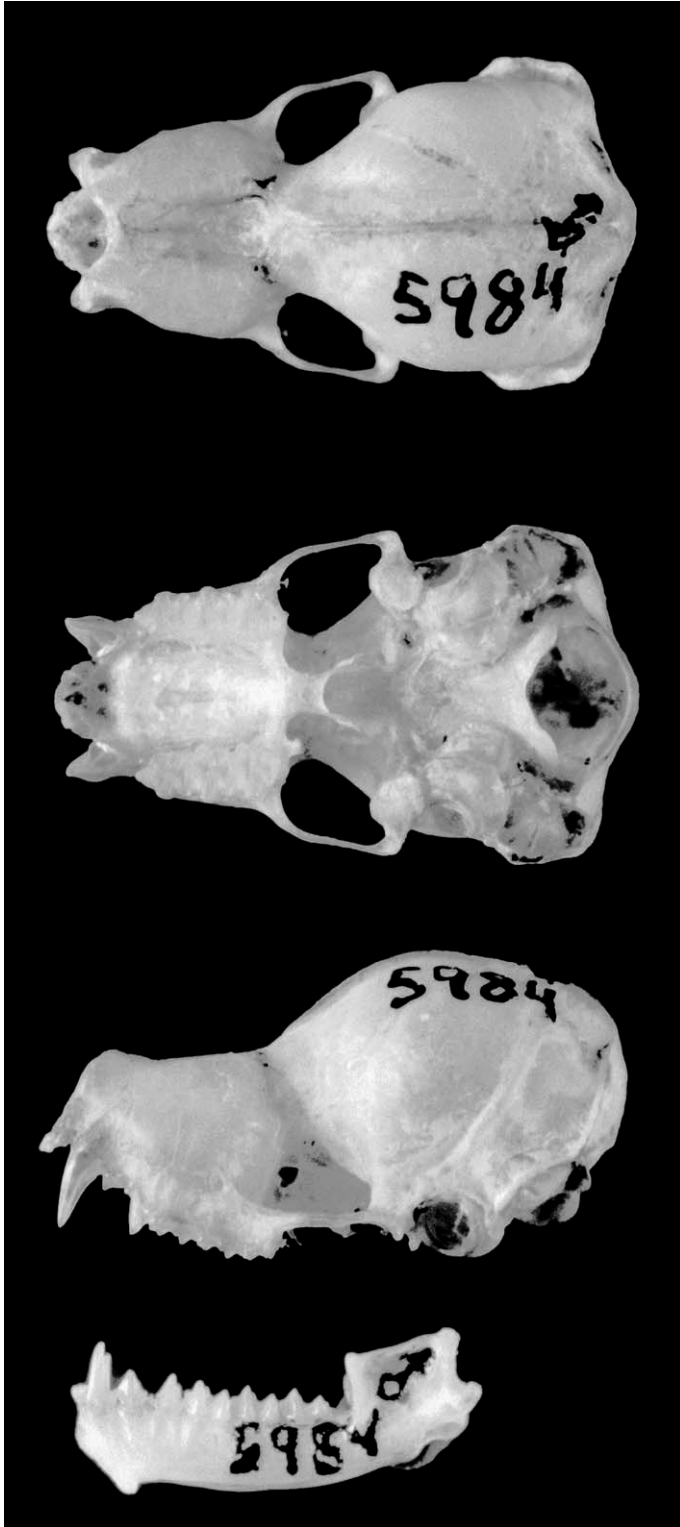
Fig. 2. —Dorsal, ventral, and lateral views of skull and lateral view of mandible of Pteronotus personatus psilotis from Autlán, Jalisco, Mexico (collected January 1962 by B. Villa-R. (IBUNAM [Instituto de Biología Universidad Nacional Autónoma de México] 5984). Greatest length of the skull is 15.6 mm.