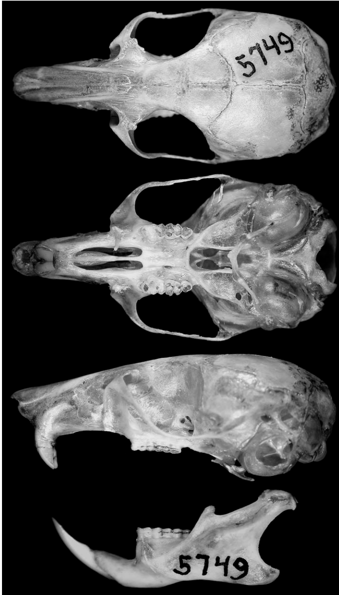
Fig. 2. —Dorsal, ventral, and lateral views of skull and lateral view of mandible of an adult male Peromyscus difficilis (Louisiana State University Museum of Natural Science [LSUMZ] 5749) from 3 km SW San Isidro, San Luis Potosí, México. Greatest length of skull is 29.6 mm.

Hooper 1958; Osgood 1909). Specimens from the nearby town of Perote and 2.4 km south of Perote, Veracruz, have the largest tympanic bullae and ears reported for P. difficilis (Hooper 1958; Osgood 1909). However, 10 topotypes from San Juan Bautista Coixtlahuaca, Oaxaca, also have large external ears and tympanic bullae, indicating that specimens from the Limón–Perote region of Veracruz are not unique in these 2 characters (Hall and Dalquest 1963). P. d. amplus differs from P. d. difficilis externally by its larger body size and dull, reddish color (Hoffmeister and de la Torre 1961).