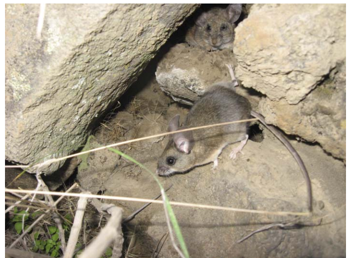
Fig. 1. —An adult male Peromyscus difficilis from 3 km S El Frijol Colorado, Veracruz, México.

P. d. saxicola Hoffmeister and de la Torre, 1959:168–169. See above.