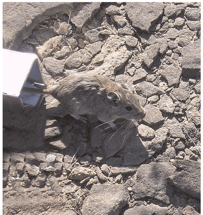
Fig. 1. —Adult Octomys mimax from Los Rastros area, Parque Natural Provincial Ischigualasto, San Juan Province, western Argentina, trapped below a jarilla shrub ( Zuccagnia punctata ,

Octomys joannius O. Thomas, 1921:217. Type locality “Pedernal, about 60 km. S. W. of San Juan, and 30 W. of Canada, Honda,” (elevation about 1,200 m).