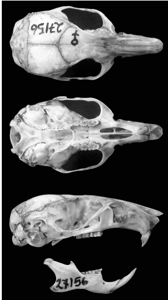
FIG. 2. Dorsal, ventral, and lateral views of cranium and lateral view of mandible of Peromyscus winkelmanni (adult female from 5 km S, 1 km W Dos Aguas, 2,450 m, Michoacán, México, Escuela Nacional de Ciencias Biológicas, Instituto Politécnico Nacional, 27156). Greatest length of cranium is 33.02 mm.

Peromyscus winkelmanni has fixed derived alleles at the glutamate oxaloacetic and sorbitol dehydrogenase loci, whereas other species of the aztecus assemblage exhibit the primitive allele at these loci; a fixed-derived allele at the MOD-1 locus was exhibited in the population of Michoacán and was absent in the rest of the aztecus species group (Sullivan and Kilpatrick 1991).