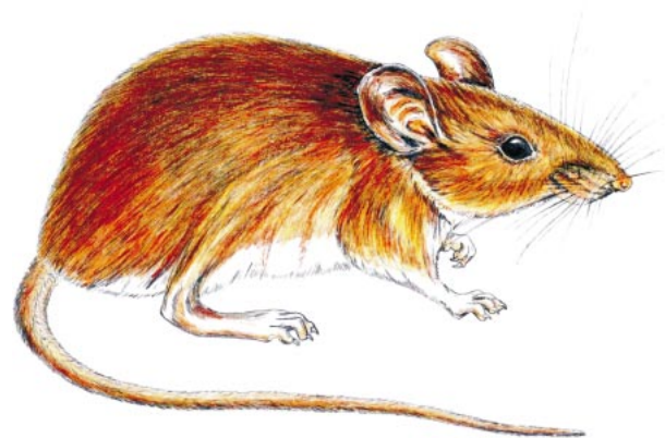
FIG. 1. Peromyscus winkelmanni drawn by Oscar Armandaris from specimen 27156 of the Escuela Nacional de Ciencias Biológicas, Instituto Politécnico Nacional. Collected at 5 km S, 1 km W Dos Aguas, 2,450 m, Michoacán, Mexico.

Based on genetic variability at 19 gene loci, P. winkelmanni from Guerrero ( n = 2 ) shows polymorphism in salivary amylase (0.50, 0.25, 0.25) and serum transferrin (0.25, 0.75), and those from Michoacán ( n = 63 ) show polymorphism in salivary amylase (0.03, 0.74, 0.21, 0.02), phosphogluconate dehydrogenase (0.97, 0.03), carbonic anhydrase (0.87, 0.13), esterases (EST-1: 0.94, 0.06; EST-2: 0.28, 0.72; EST-5: 0.93, 0.07), phosphoglucomutase (0.99, 0.01), isocitrate dehydrogenase (0.52, 0.48), and lactate dehydrogenase (0.02, 0.98—Sullivan and Kilpatrick 1991).