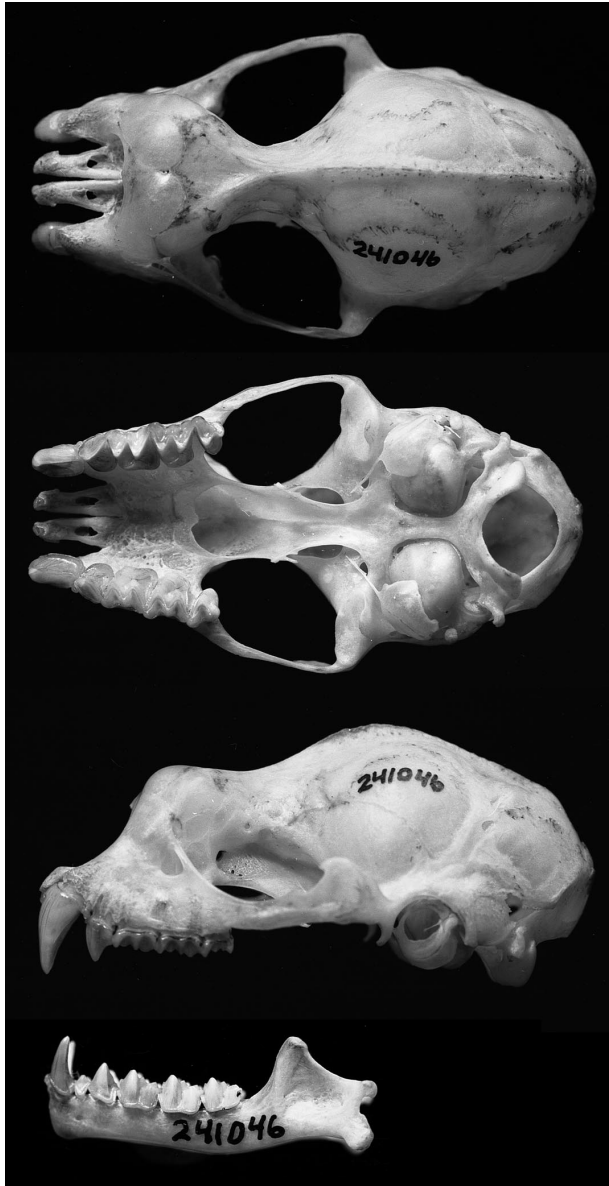
FIG. 2. Dorsal, ventral, and lateral views of cranium and lateral view of mandible of Hipposideros cyclops from 30 km West of Bertoua, Cameroon (female, AMNH 241046). Greatest length of cranium is 28.5 mm.