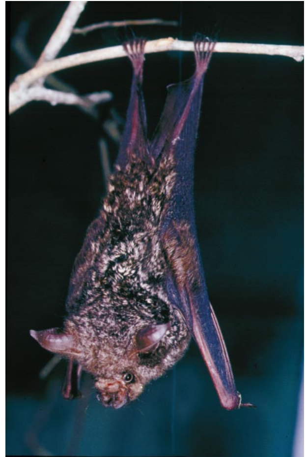
FIG. 1. Female Hipposideros cyclops at IET-Station, Taï National Park, Côte d'Ivoire, on 8 March 1999.