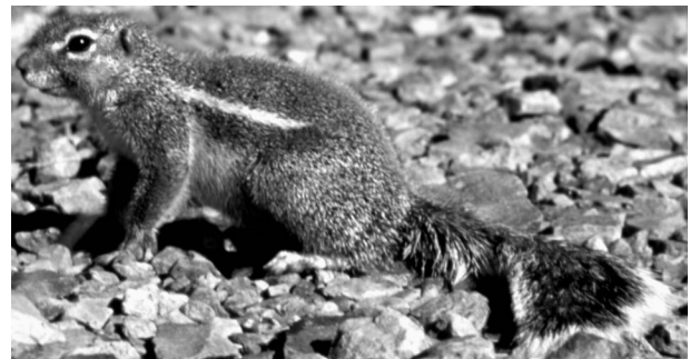
FIG. 1. Adult Xerus princeps from Namibia.

ONTOGENY AND REPRODUCTION. No juveniles (<8 weeks of age) have been observed during summer (November–January—Herzig-Straschil and Herzig 1989). Gestation is ca. 42–49 days and litter size is 1–3 (Herzig-Straschil and Herzig 1989). Eyes open within 21 days of birth (Herzig-Straschil and Herzig 1989).