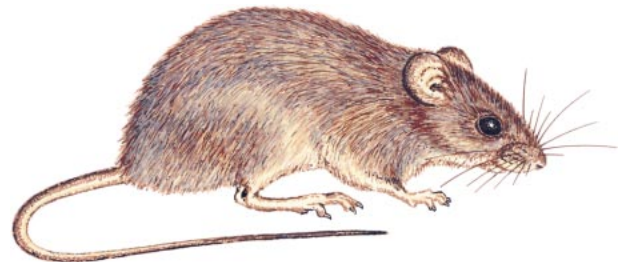
FIG. 1. Oryzomys nelsoni drawn from specimen 89202 of the United States Museum of Natural History. Drawing by Oscar Armendariz.

REMARKS. After extensive trapping produced only a few specimens, O. nelsoni is believed to be rare (Nelson 1899). More recent trapping in the type locality known as the "Sacatal" (because of the unusually lush growth of grass), revealed only Rattus rattus (Wilson 1991). Although Hershkovitz (1971) listed O. nelsoni as a subspecies of O. couesi , Goldman (1918) and Hall (1981) maintain that it is a distinct species in view of its unique differentiation from mainland O. couesi . O. nelsoni is known from only by 4 specimens of the type series and is presumed extinct (Wilson 1991). It is listed