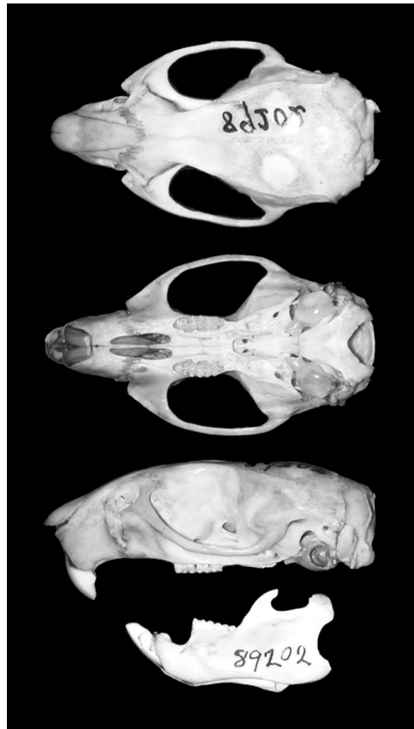
FIG. 2. Dorsal, ventral, and lateral views of cranium and lateral view of mandible of Oryzomys nelsoni (adult from Mexico, United States Museum of Natural History #89202). Greatest length of cranium is 34.9 mm.