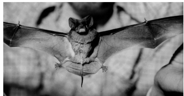
FIG. 1. An adult Eumops bonariensis at Agua Dulce (about 170 km W Bahia Negra), Defensores del Chaco National Park in the northern Chaco, Paraguay.

Peters' mastiff bat has significant geographic variation in size. E. b. bonariensis averages larger than E. b. beckeri , E. b. delticus ,