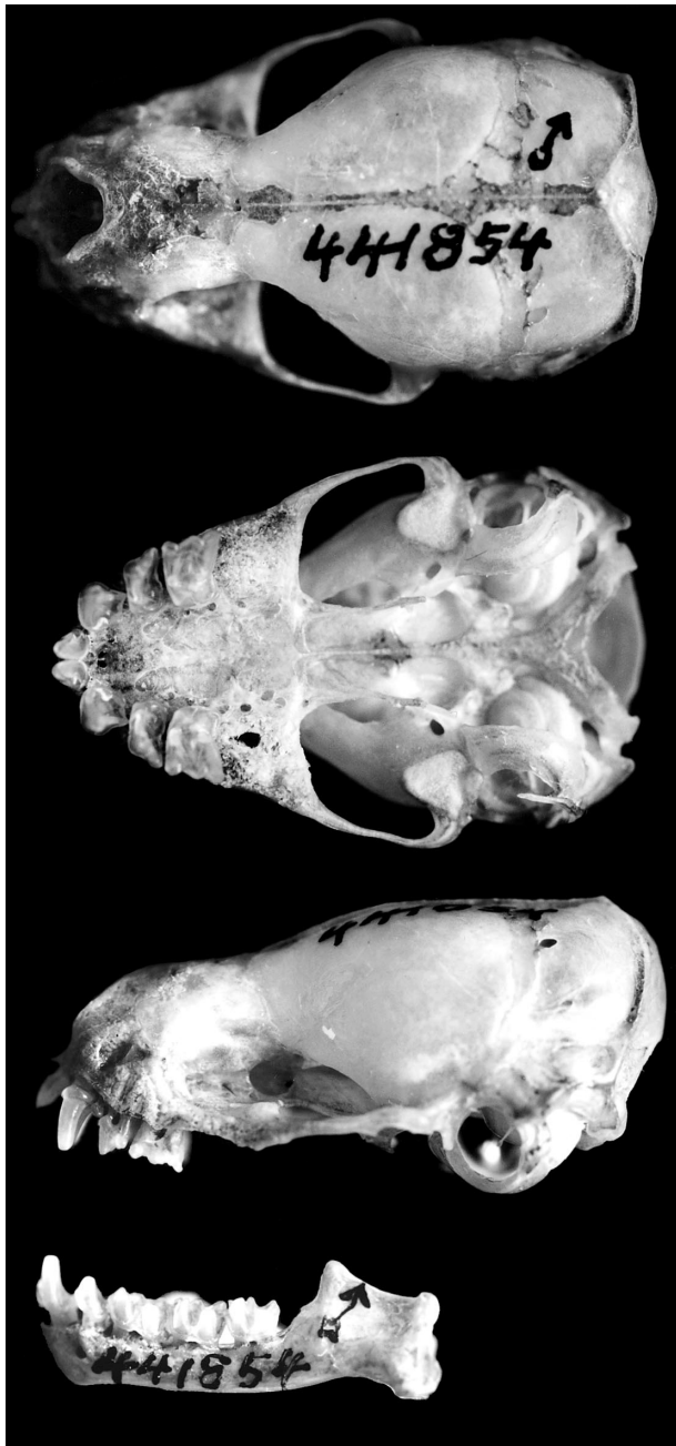
FIG. 2. Dorsal, ventral, and lateral views of cranium and lateral view of mandible of Eumops bonariensis nanus from 119 km N, 32 km W Maracaibo, Departamento Guajira, Colombia (male, United States National Museum of Natural History 441854). Greatest length of cranium is 16.5 mm.

and E. b. nanus in all characters and is distinguished by length of forearm and condylobasal length. Average of external and cranial measurements (in mm) of up to 23 male and 50 female E. b. beckeri are: length of forearm, 44.2, 44.1; total length of cranium, 18.3, 17.9; condyloincisive length, 17.1, 16.5; zygomatic breadth, 10.8, 10.7; mastoidal width, 10.2, 10.1; height of braincase, 6.5, 6.4; length of upper maxillary tooththrow, 6.9, 6.7; and postorbital constriction, 4.2, 4.1 (Eger 1977).