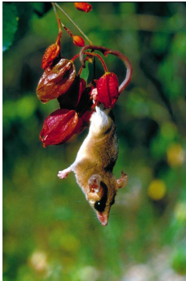
FIG. 1. Marmosa canescens from Chamela, Jalisco, Mexico.

DISTRIBUTION. Marmosa canescens is endemic to Mexico (Fig. 3). It is a Neotropical species, with the northernmost distribution in its genus. It occurs along the tropical lowlands of the Pacific coast, from the tip of the Baja California Peninsula and southern Sonora to south-central Sinaloa, western Durango, and a small part of Zacatecas, southward to Chiapas. The geographic range extends to central Mexico through the Balsas river basin from the Michoacán coast to Puebla. Isolated populations occur in the Yucatán Peninsula and the Tres Marías Islands off Nayarit coast. In the Yucatán Peninsula, it occurs in northern dry forest. M. canescens has been recorded in the states of Baja California Sur, Chiapas, Colima, Durango, Guerrero, Jalisco, Michoacán, México, Morelos, Nayarit, Oaxaca, Puebla, Quintana Roo, Sonora, Sinaloa, Yucatán, and Zacatecas (Álvarez del Toro 1977; Armstrong and Jones 1971; Ceballos and Miranda 2000; Hall 1981; Matson 1977; Nelson 1899; Sánchez-Hernández and Gaviño de la Torre 1988). In the Baja California Peninsula, a single record is from an owl pellet from the dry tropical forest in the southernmost tip of the peninsula (López-Forment and Urbano-V. 1977). The gray mouse opossum is generally found from sea level to 2,100 m, but most localities are below 1,000 m (Reid 1997).